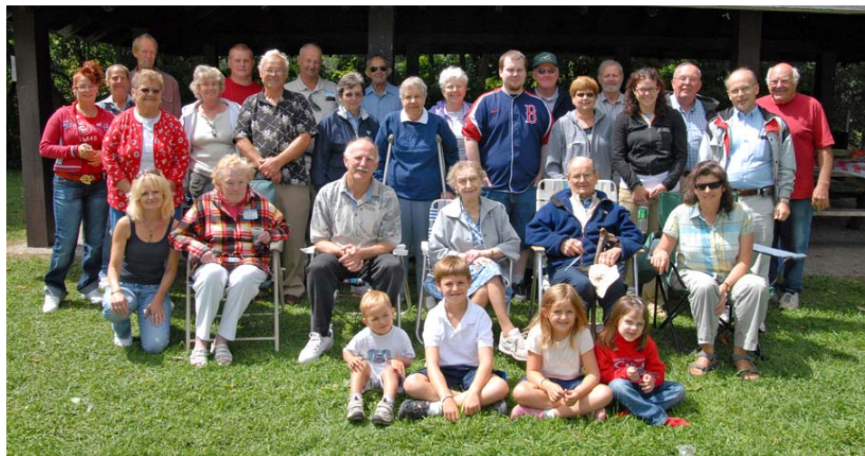
2007 Vincent Reunion - Hopefully we will see a big turnout this year.

Additional copies of the book The Vincent Family , Third Edition (1998) will be available at $35.