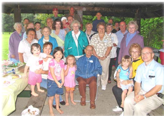
2004 Vincent Reunion

Additional copies of the book The Vincent Family , Third Edition (1998) will be available at $35.